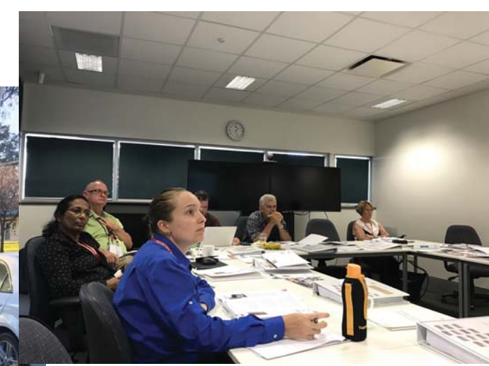
Darwin network meeting