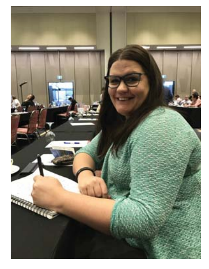
Network meeting in Melbourne