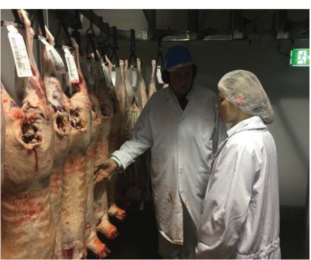
Out with MINTRAC