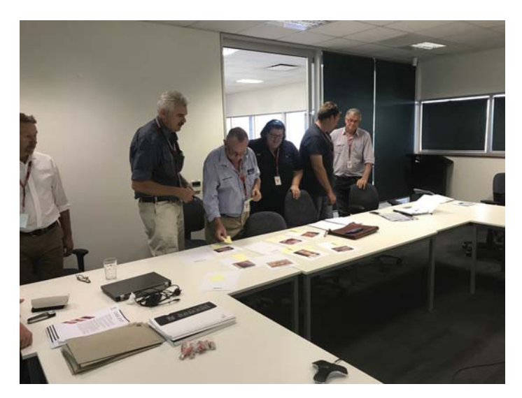
Network meeting in Darwin